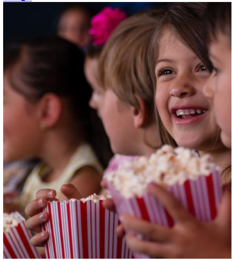
Small Business Saturday® Kids' Movie and Craft