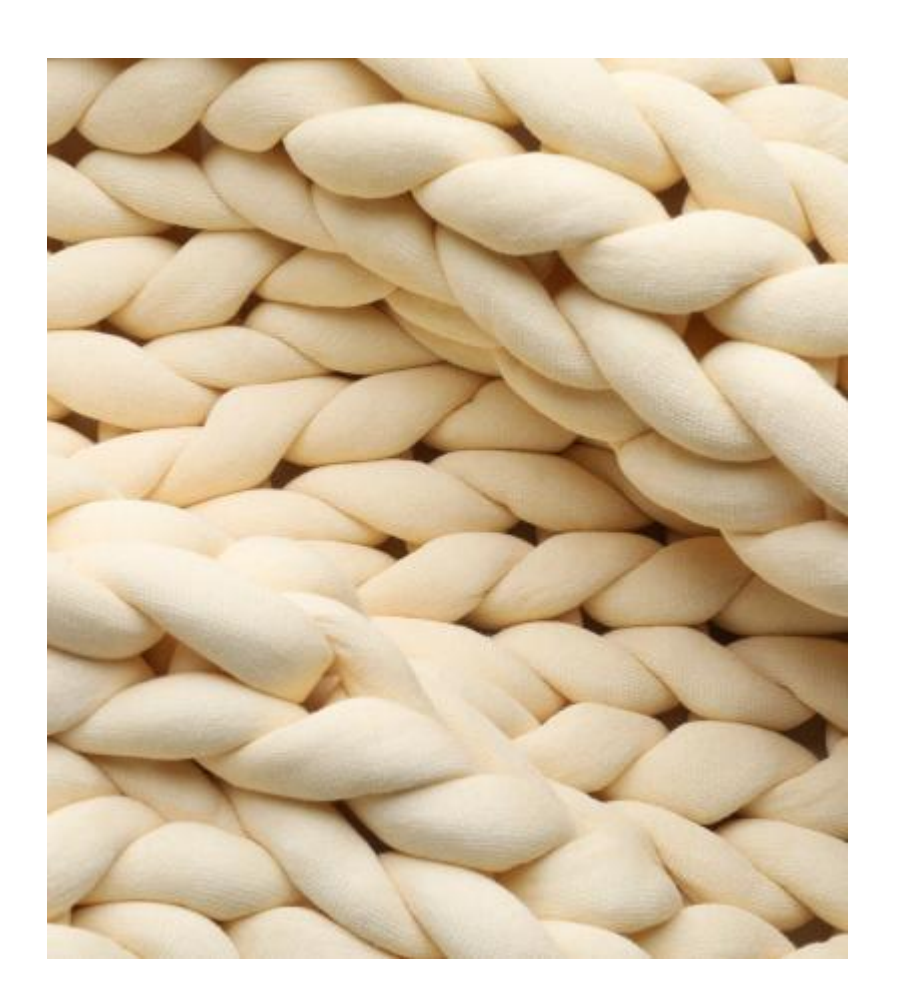
DIY Chunky Knit Blanket Class