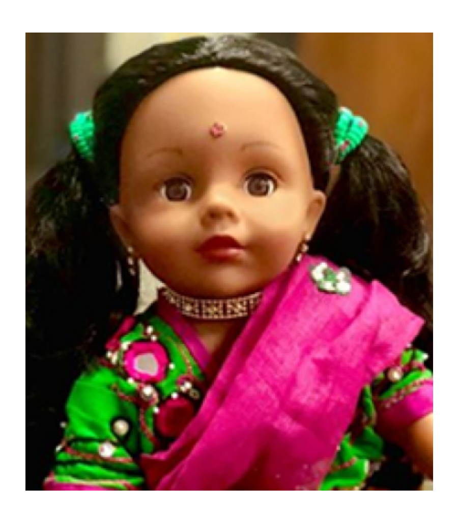
Library Designs Doll to Celebrate Community