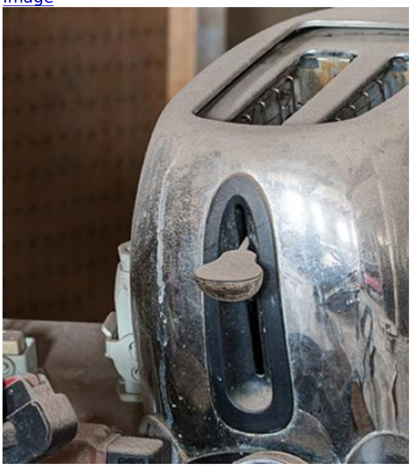
Don't Throw It Out! Fix It at a Repair Café