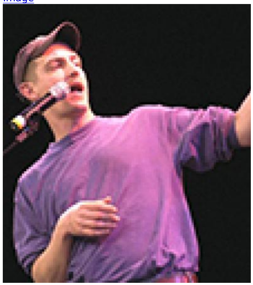
Kansas City Keeps Storytelling Alive