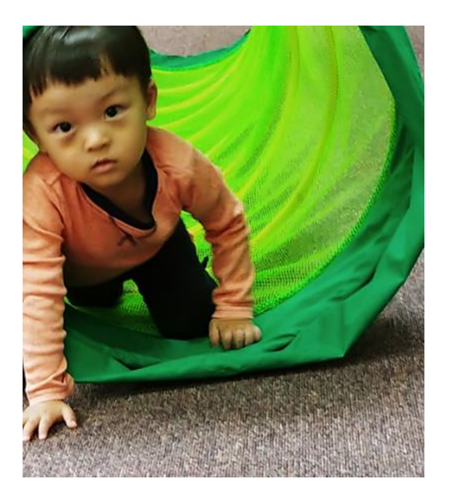
Special Olympics Young Athletes Program Creates Environments for Inclusive Play Partner