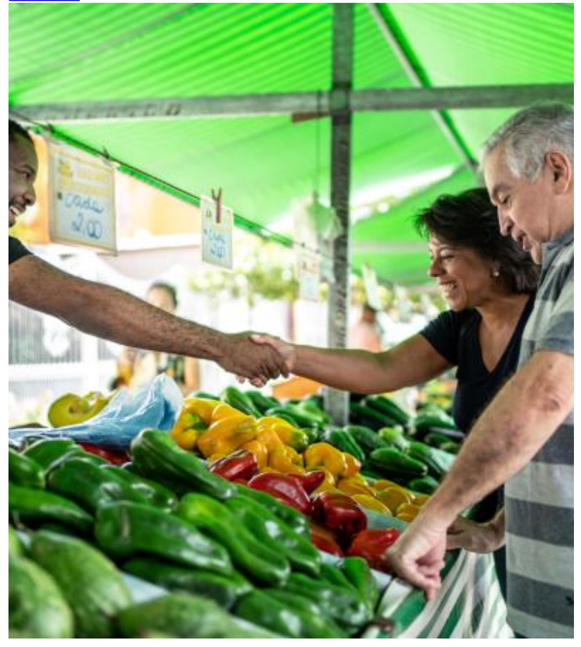
Don't Do It All Yourself: Creating Health Fairs through Partnerships