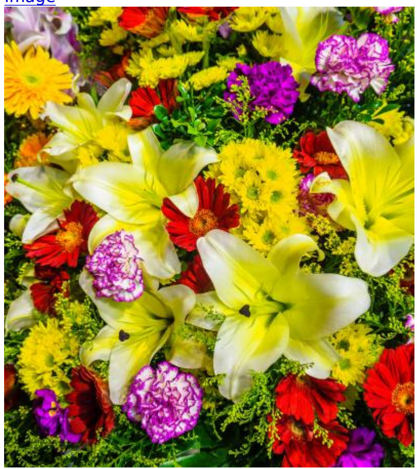
Flower Petal Suncatchers