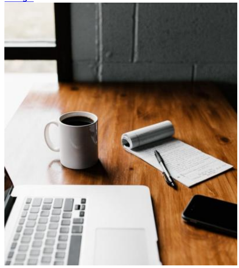
Virtual Programming Resource Round-up