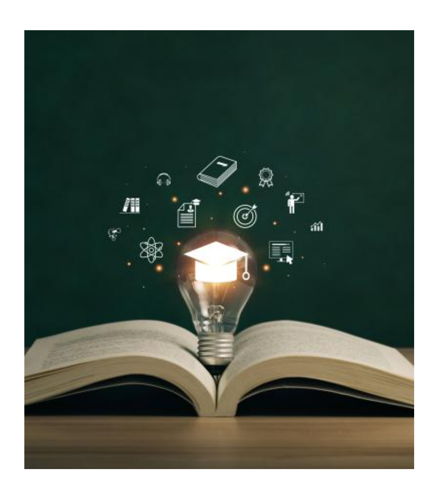
Virtual Tales & Travel Adventures