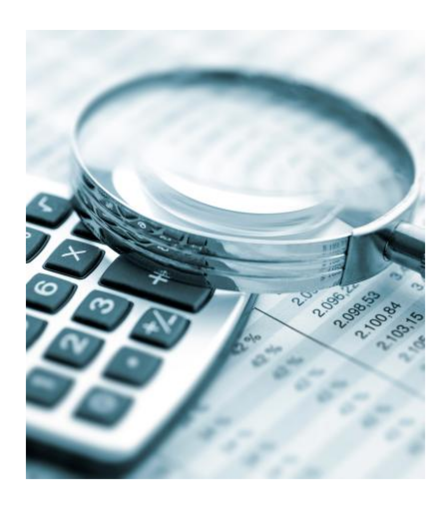
Money Madness Teen Lock-in