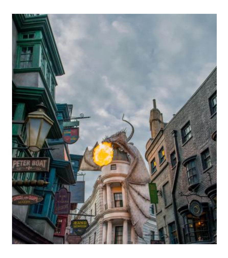
Harry Potter Escape Room (on a $0 Budget)