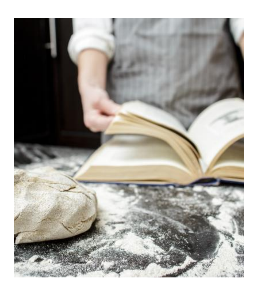
Books & Baking