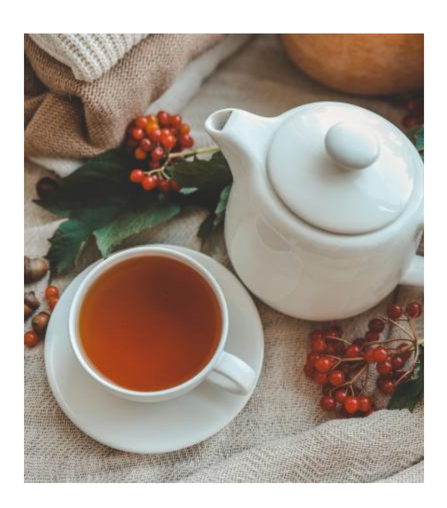
Bridgerton High Tea