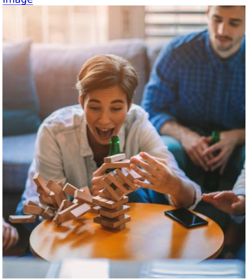
Game Night at the Library