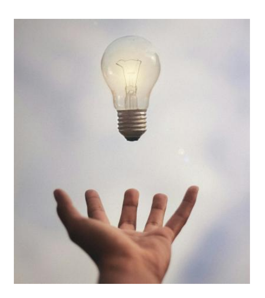
Donation Helps Public Library Open Tech Center

Audience Young Adult (17 - 20) Adults (21 and up) Intergenerational Mar 19, 2015 Young Adult (17 - 20)+ | $$ Image