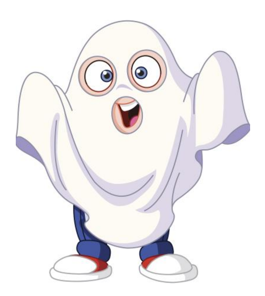
Ghost Hunting at the Library