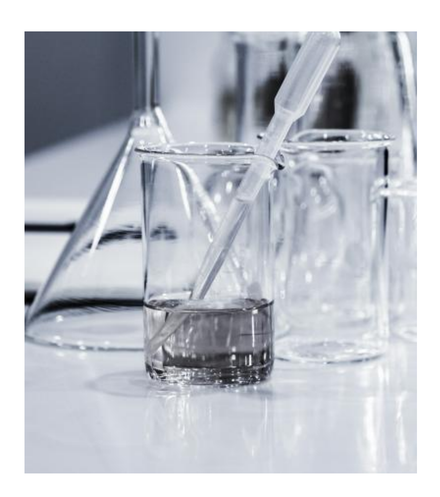
A Visit to Chicago Public Library's Maker Lab