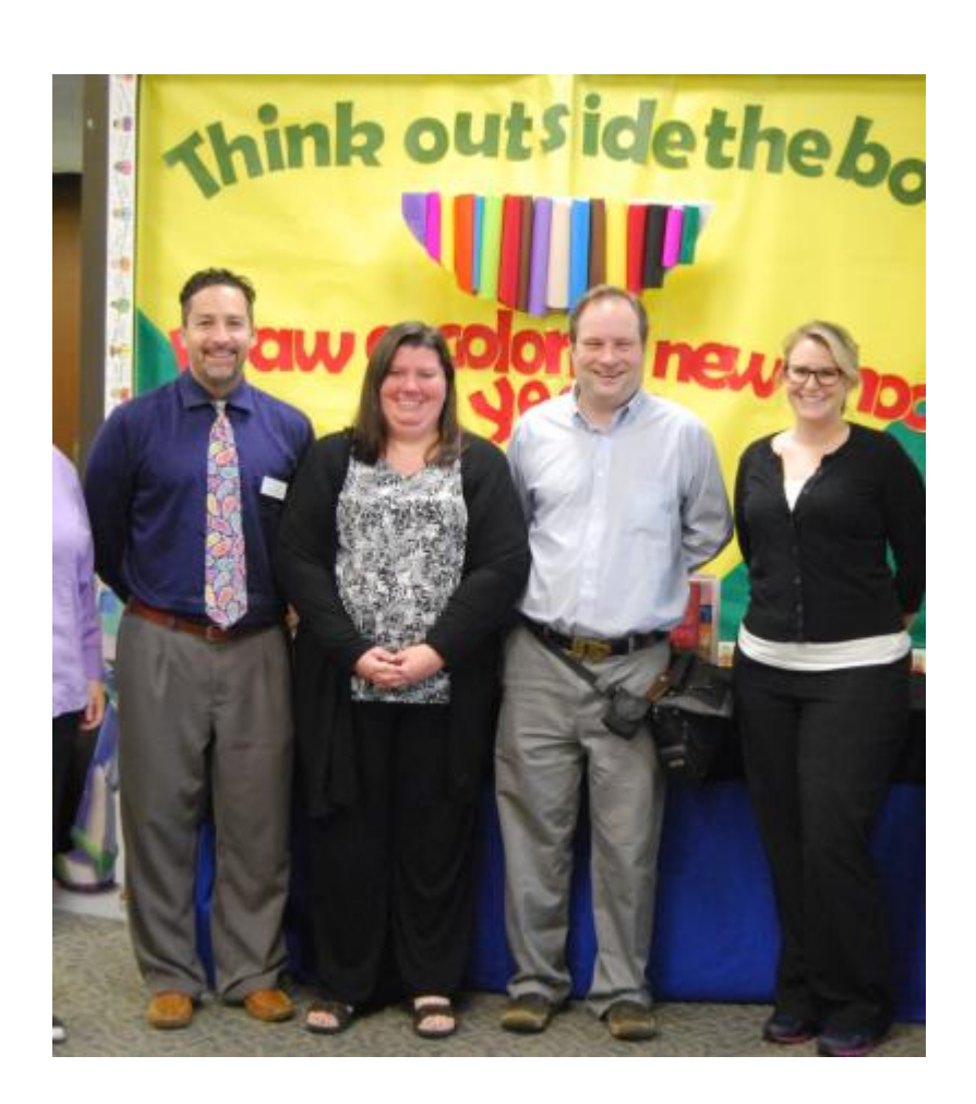
Getting Started with the Harwood Approach