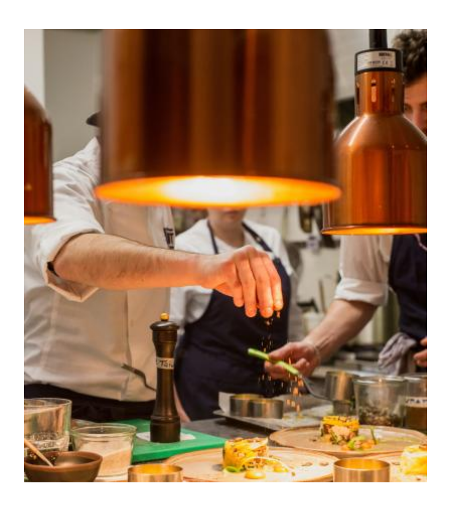
If You Feed Them, They will Come