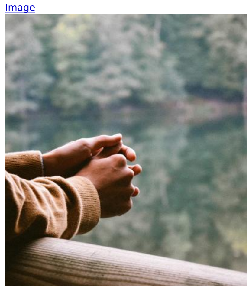
May is Mental Health Month