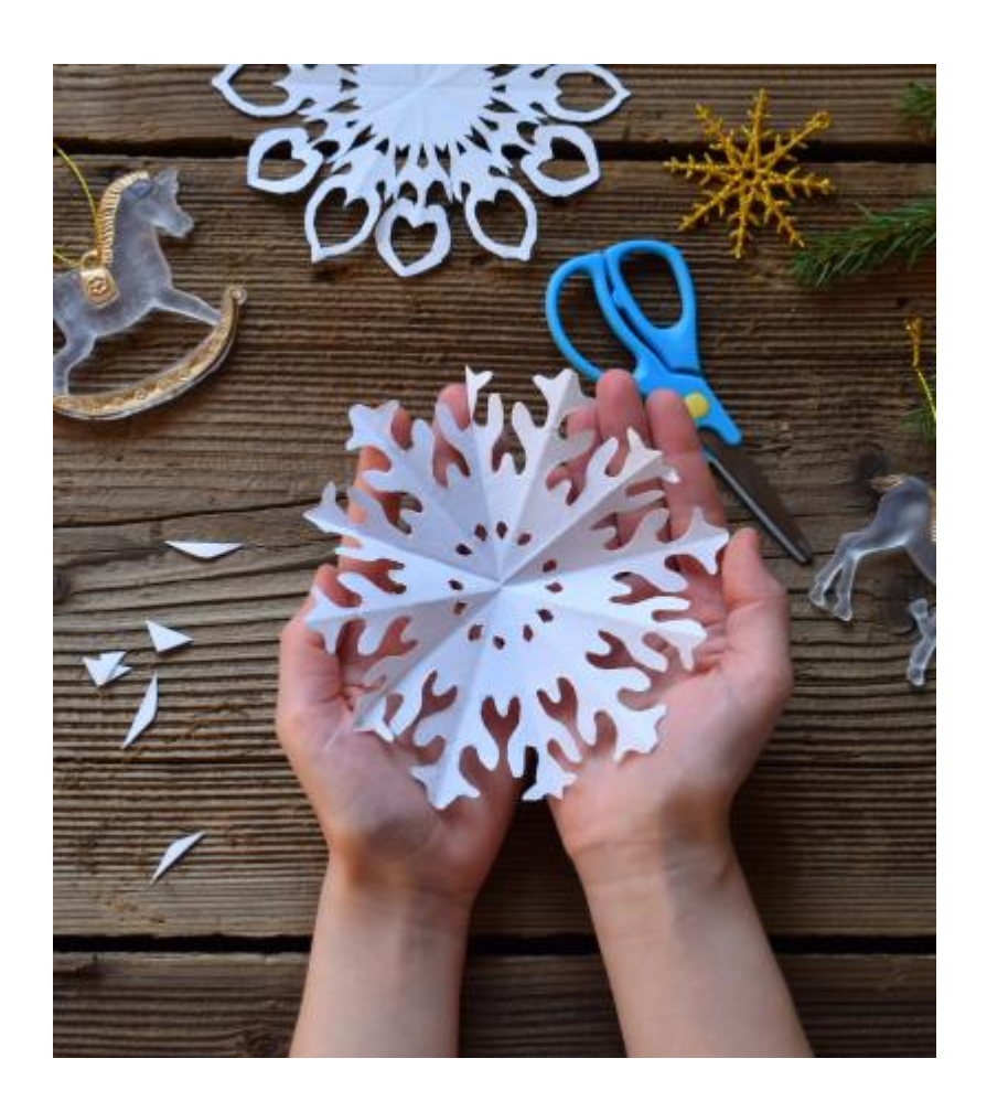
3D Paper Snowflakes