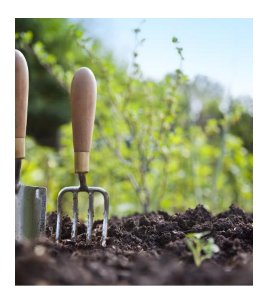
Get Started Gardening at Your Library