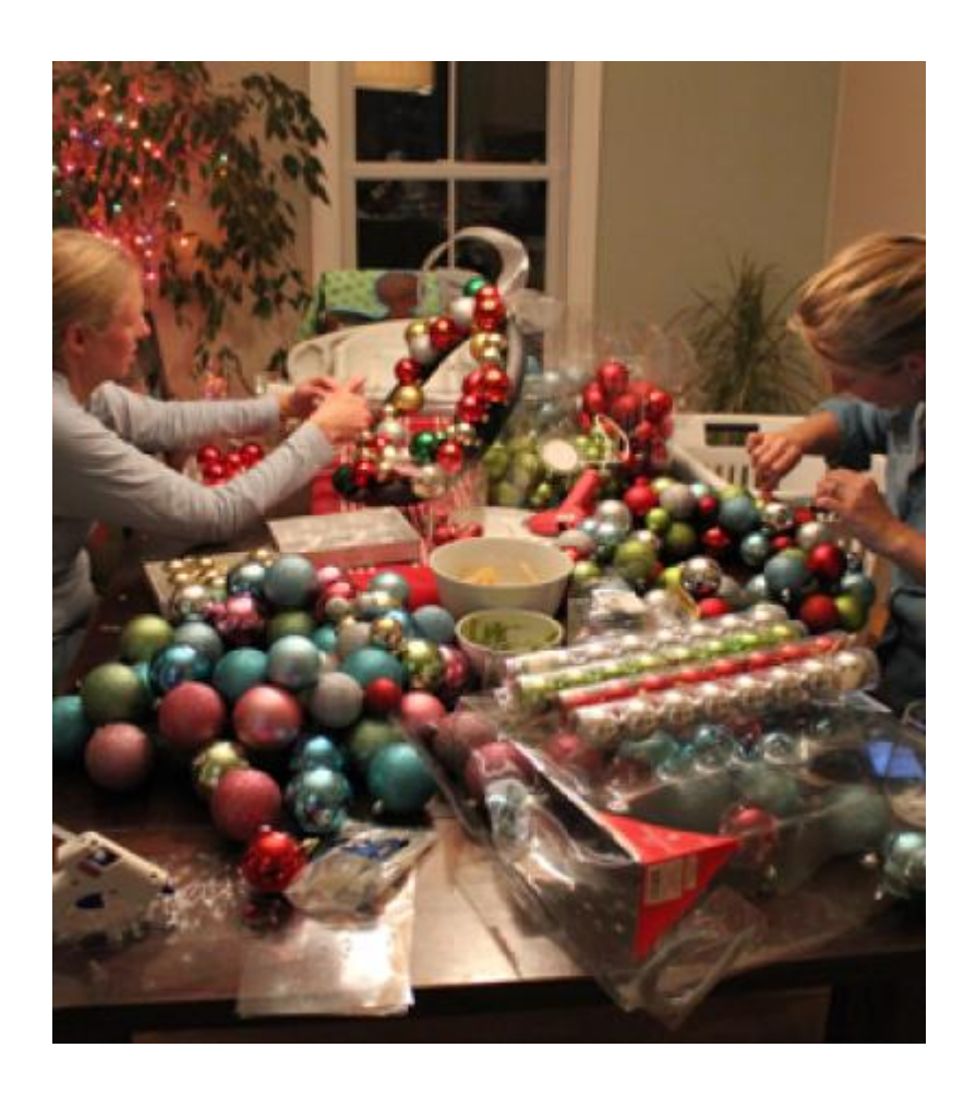
Holidaze Crafts for Teens