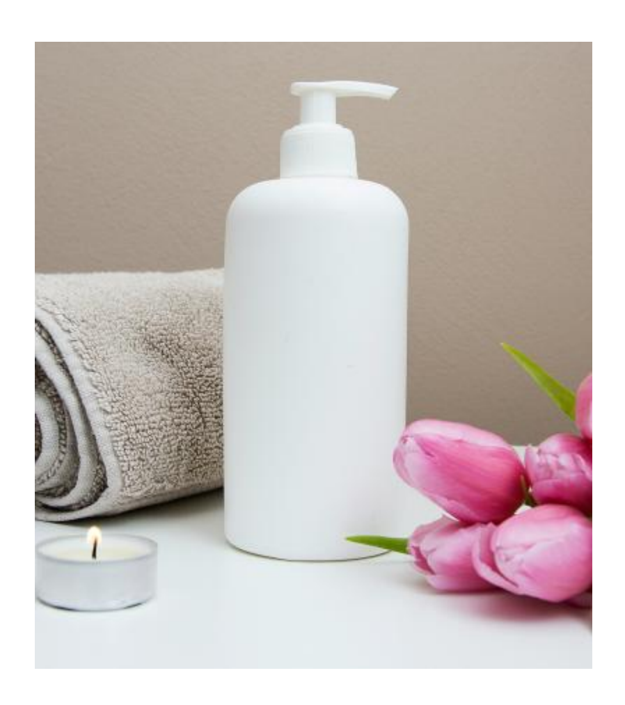
Keep Calm and Take a Spa Day