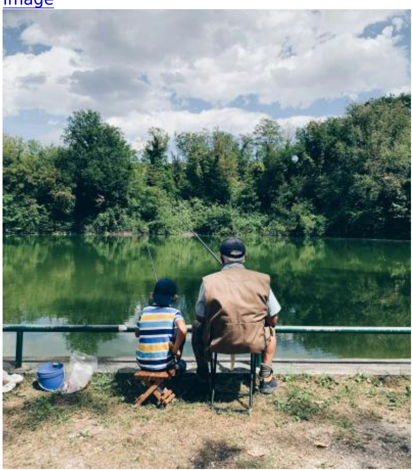
Bring Generations Together through Storytelling