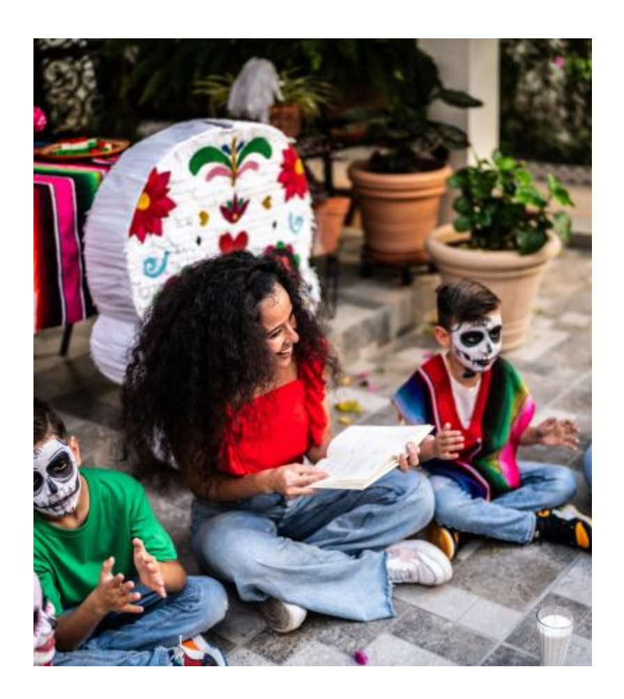
A Celebration of Latino Lives in Florida