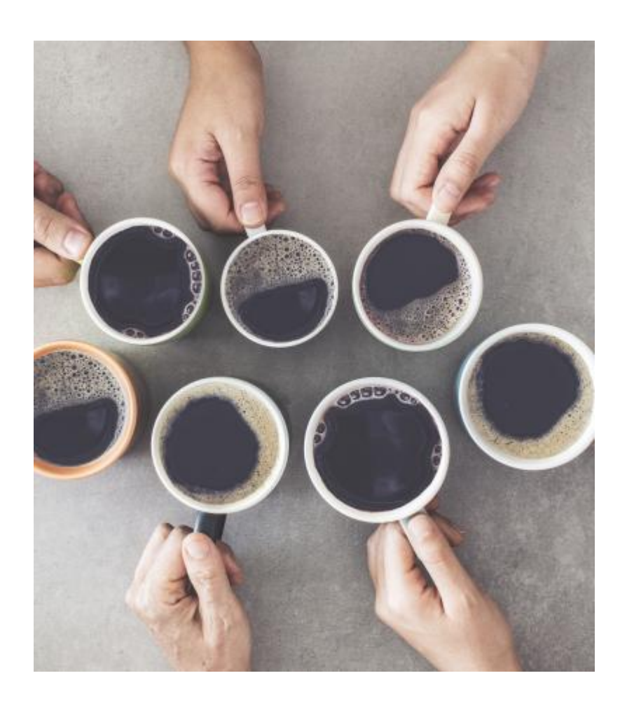
Coffee & Conversation