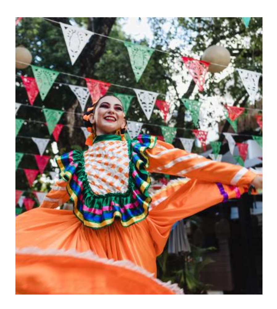
The Journeys of my Life / Viajes de mi Vida