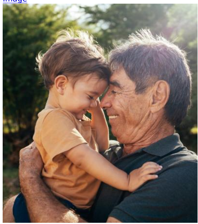
Olathe Hispanic Heritage Month