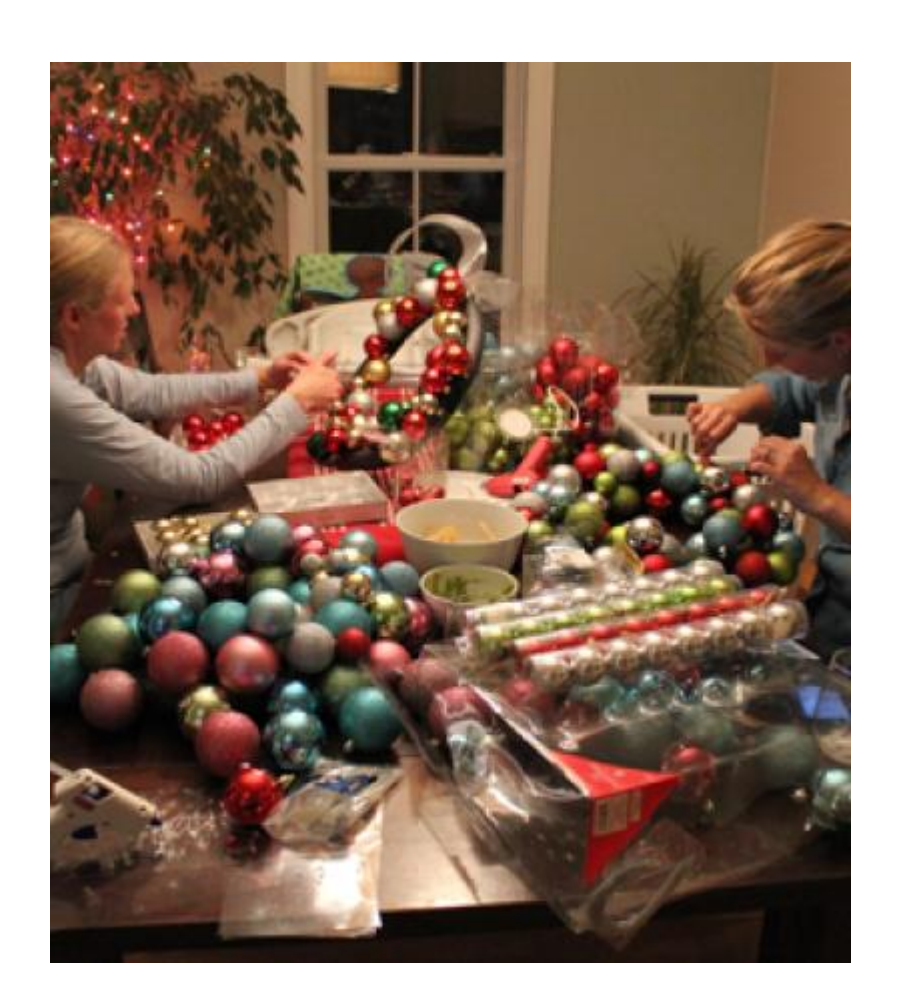
Holidaze Crafts for Teens

Audience Young Adult (17 - 20) Jul 11, 2016 Young Adult (17 - 20)+ | $ <u>Image</u>