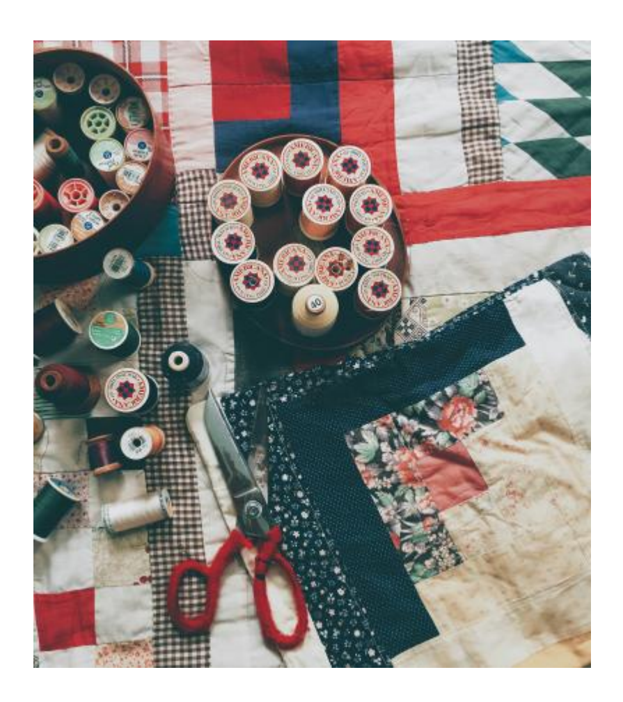
Thinking Outside the Makerspace

Audience Adults (21 and up) Dec 7, 2015 Young Adult (17 - 20)+ | $ Image