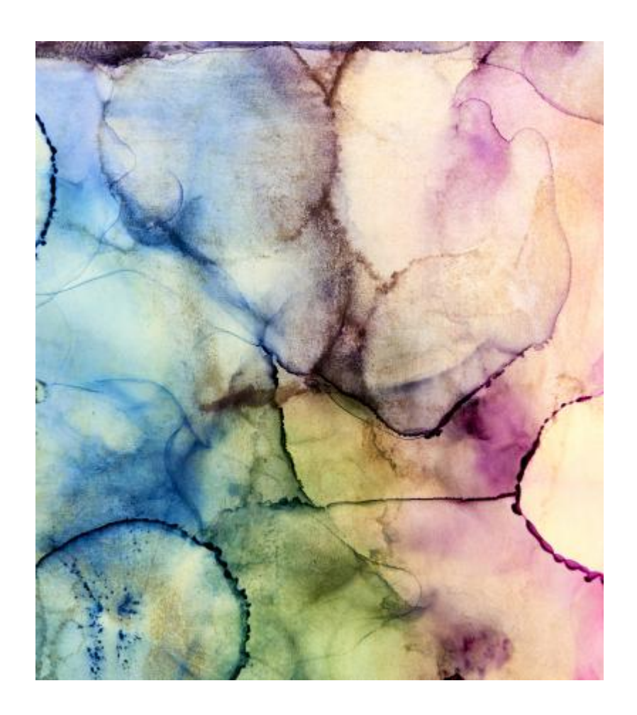
Ink Floating for Teens

Children (9 and under) Young Adult (17 - 20) Adults (21 and up) Intergenerational Jul 15, 2016 Children (9 and under)+ | $ Image