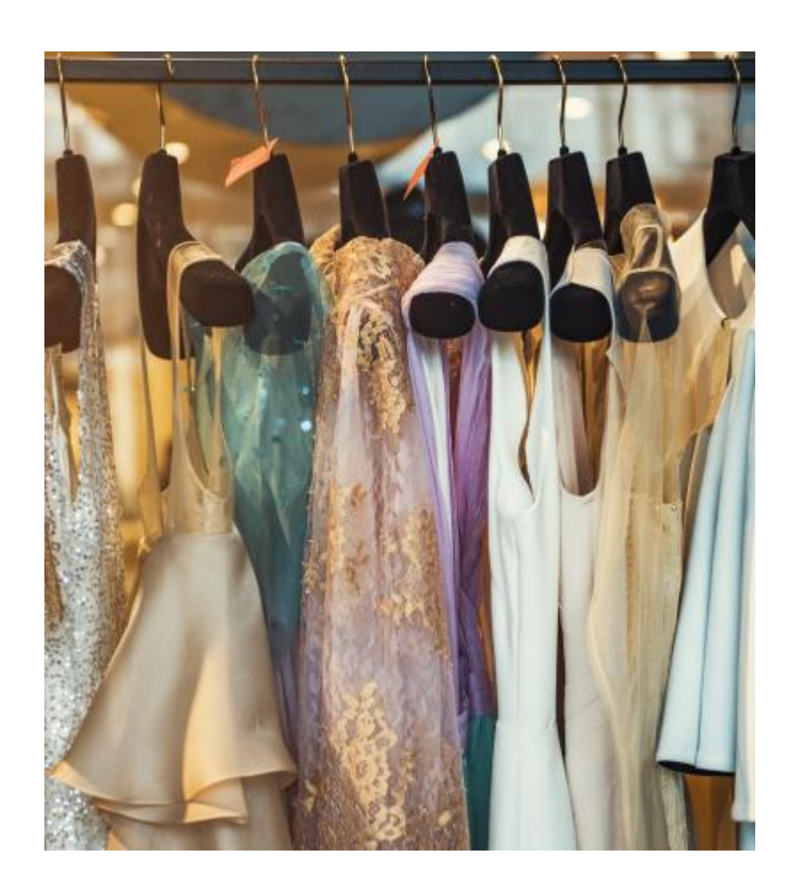
Once Upon a Formal