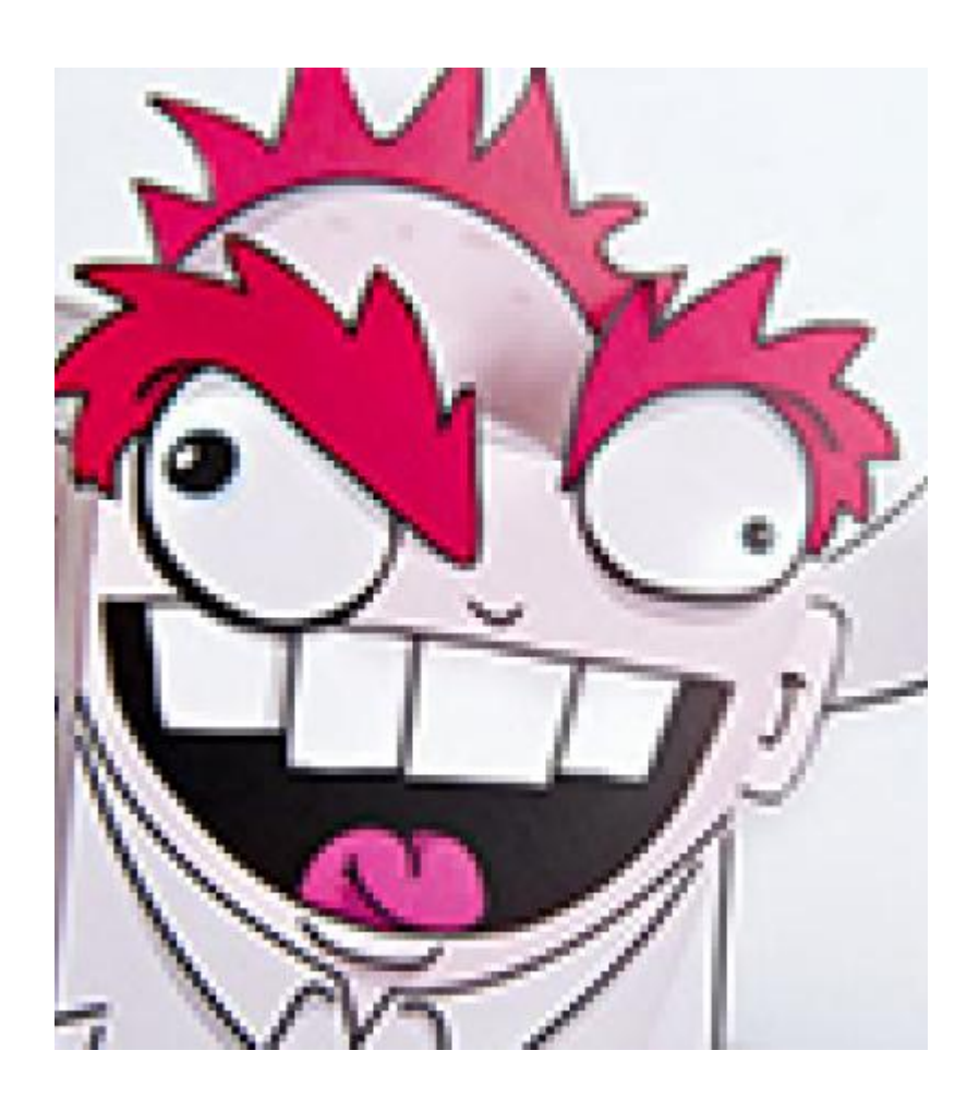
Science in the Summer