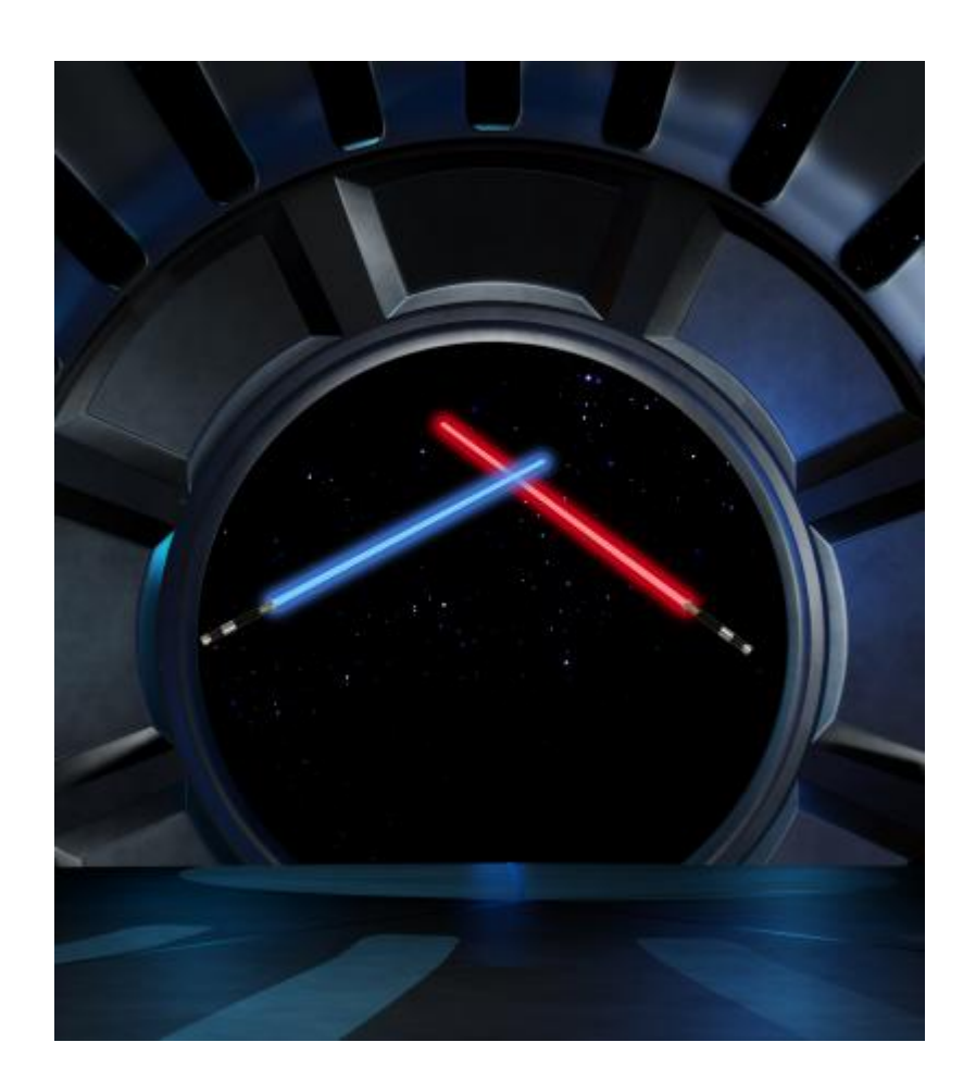
'Star Wars' Celebration