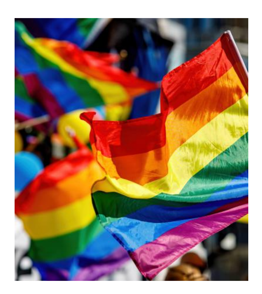
Pride @ the Library