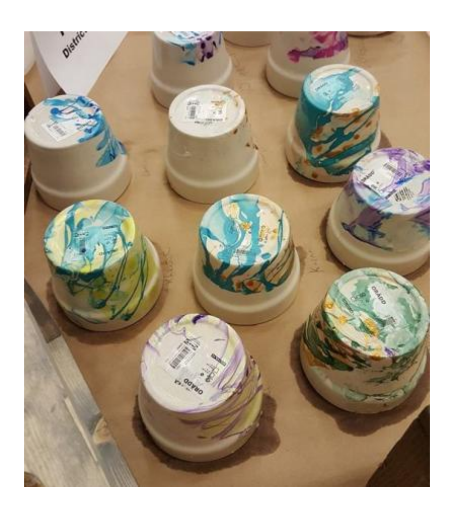
Nail Polish Pots