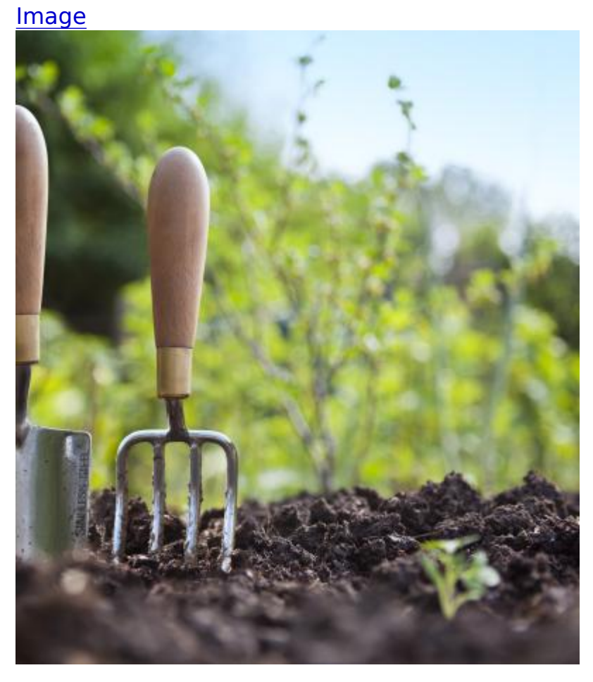
Get Started Gardening at Your Library