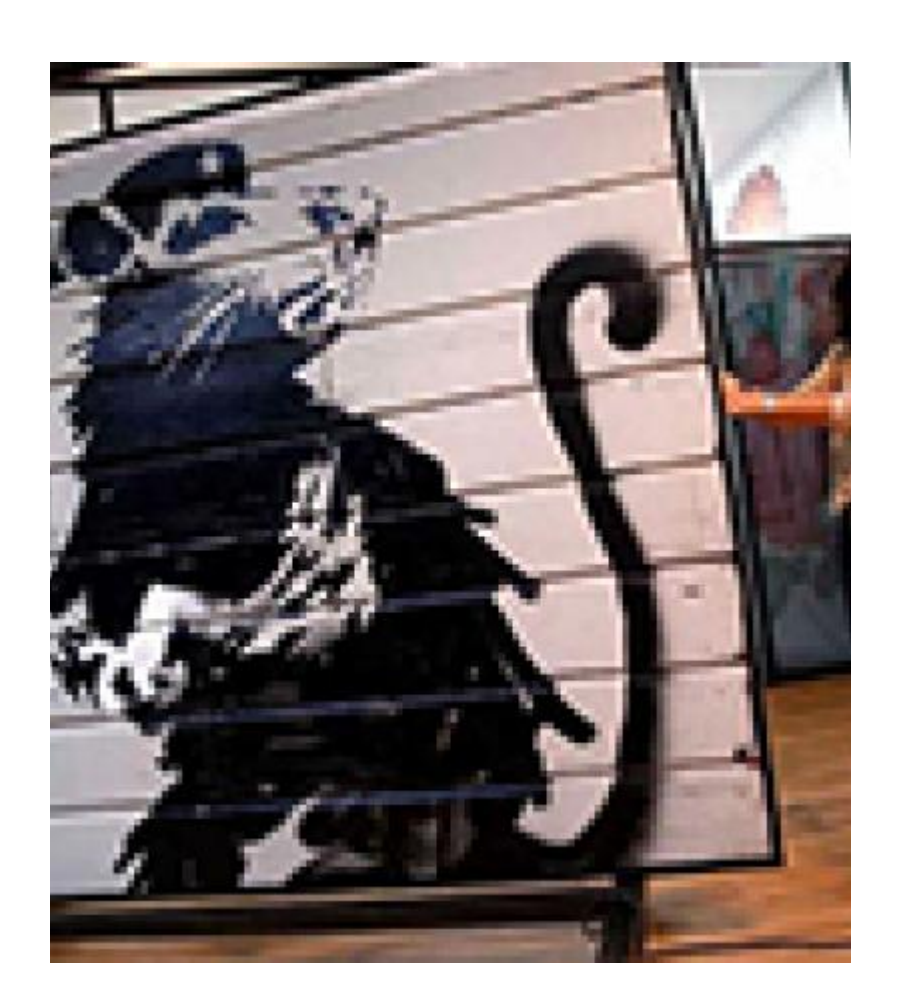
Indiana Library Displays Art by Banksy