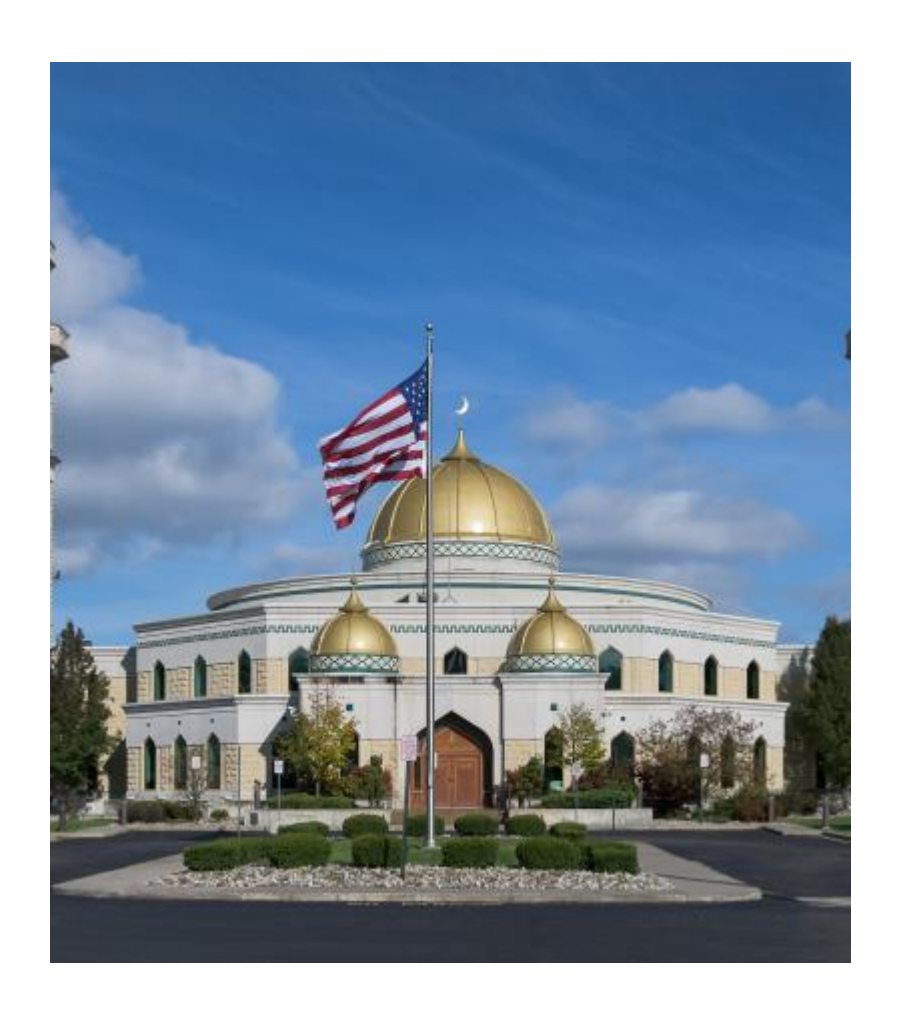
American Muslims in Indiana: A Community Discussion