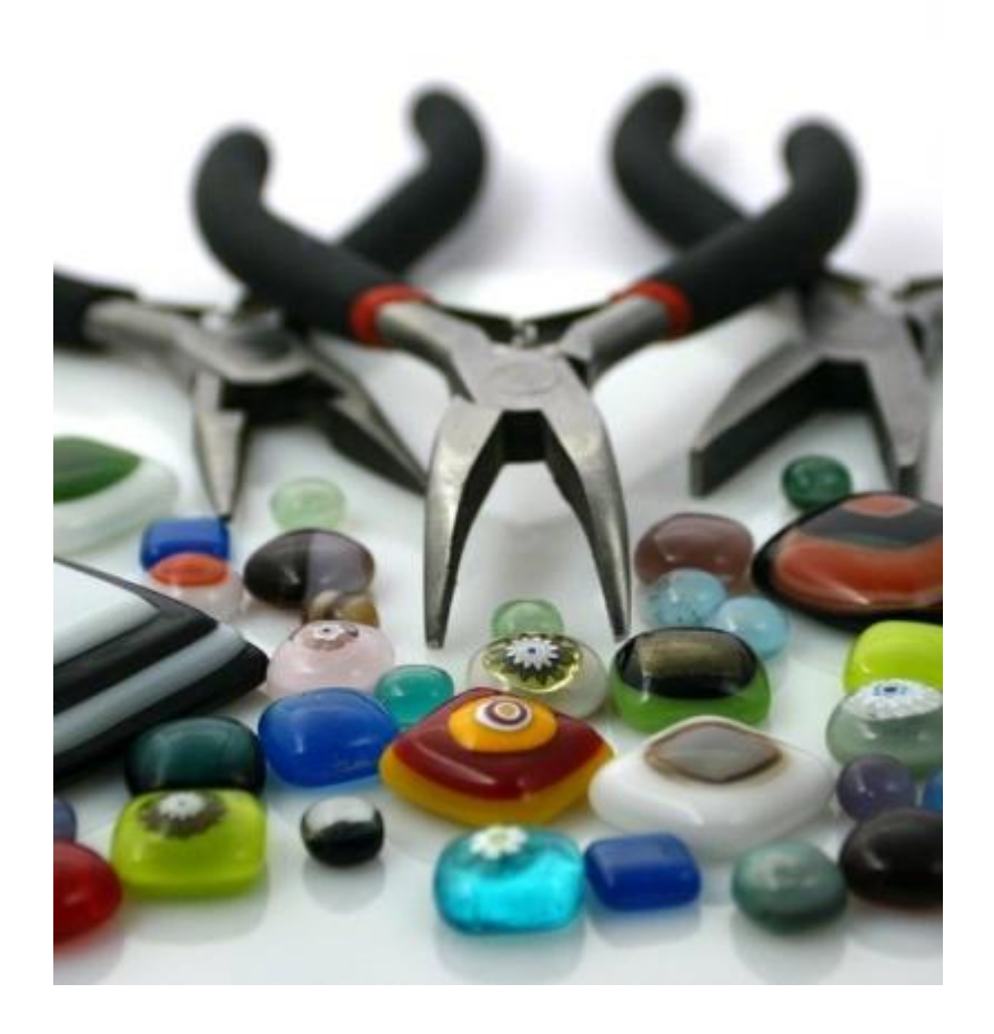
Creating an Upcycled Jewelry Program