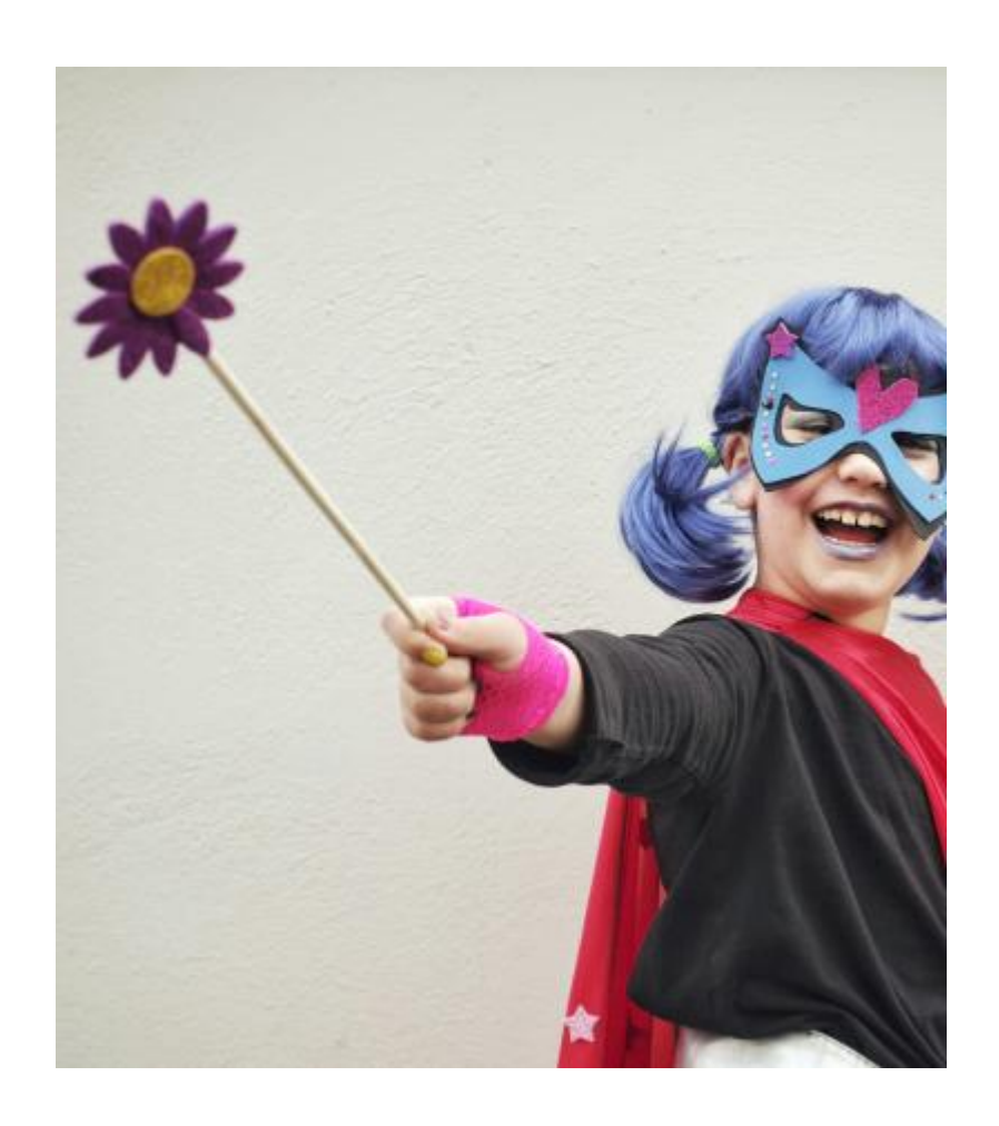
Literary Costume Party