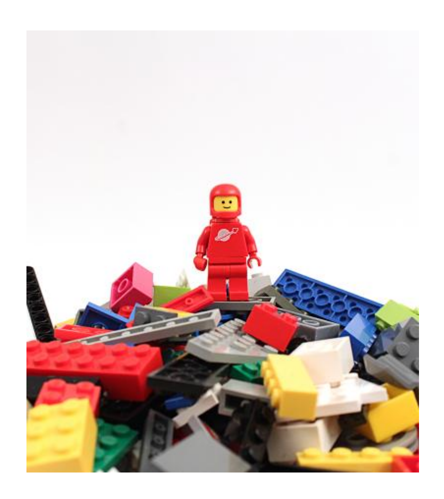
LEGO Building Challenge