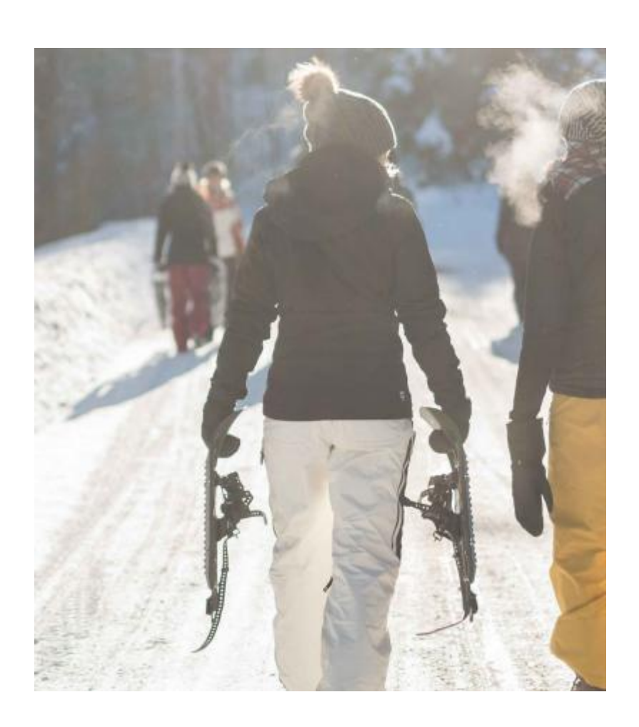
Snowshoe in February