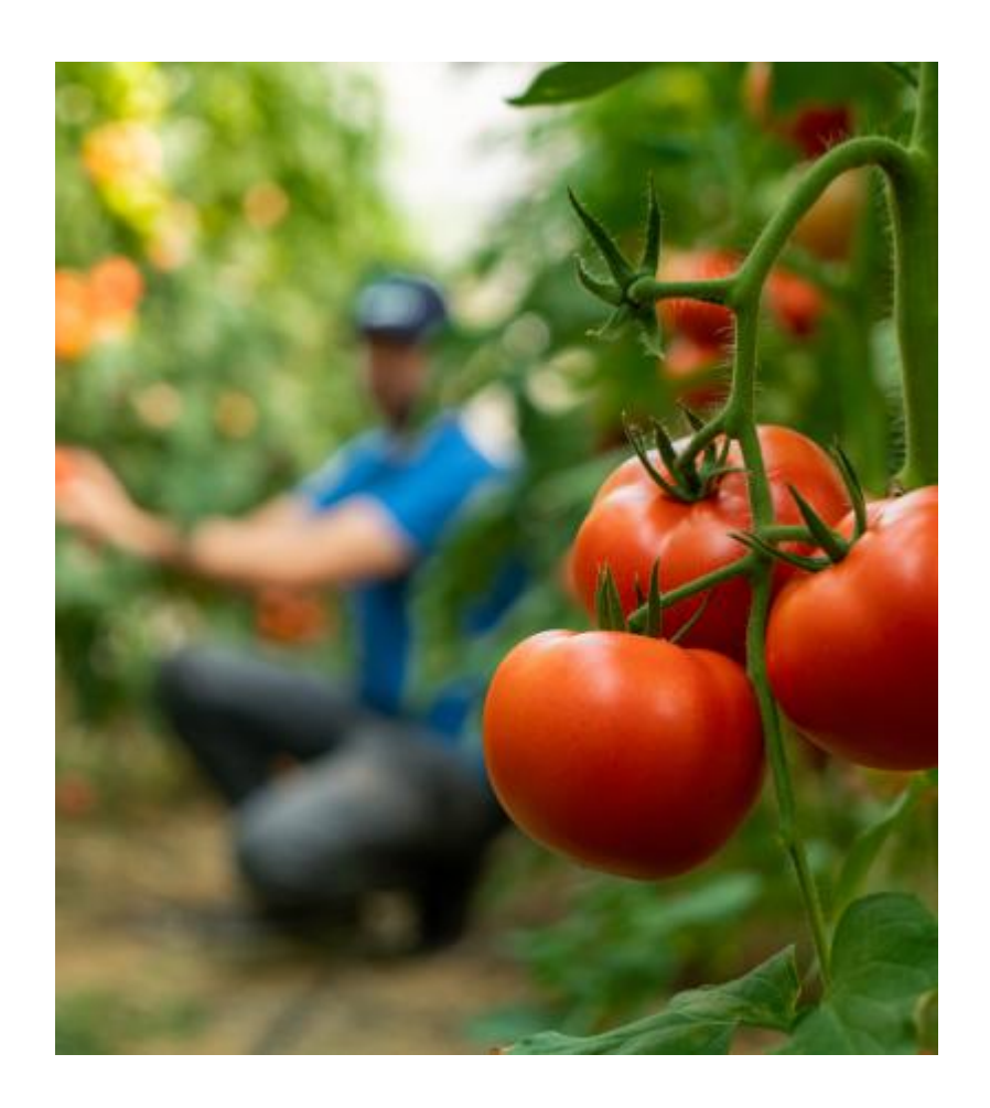
Mechanicville Farmers Market & Garden