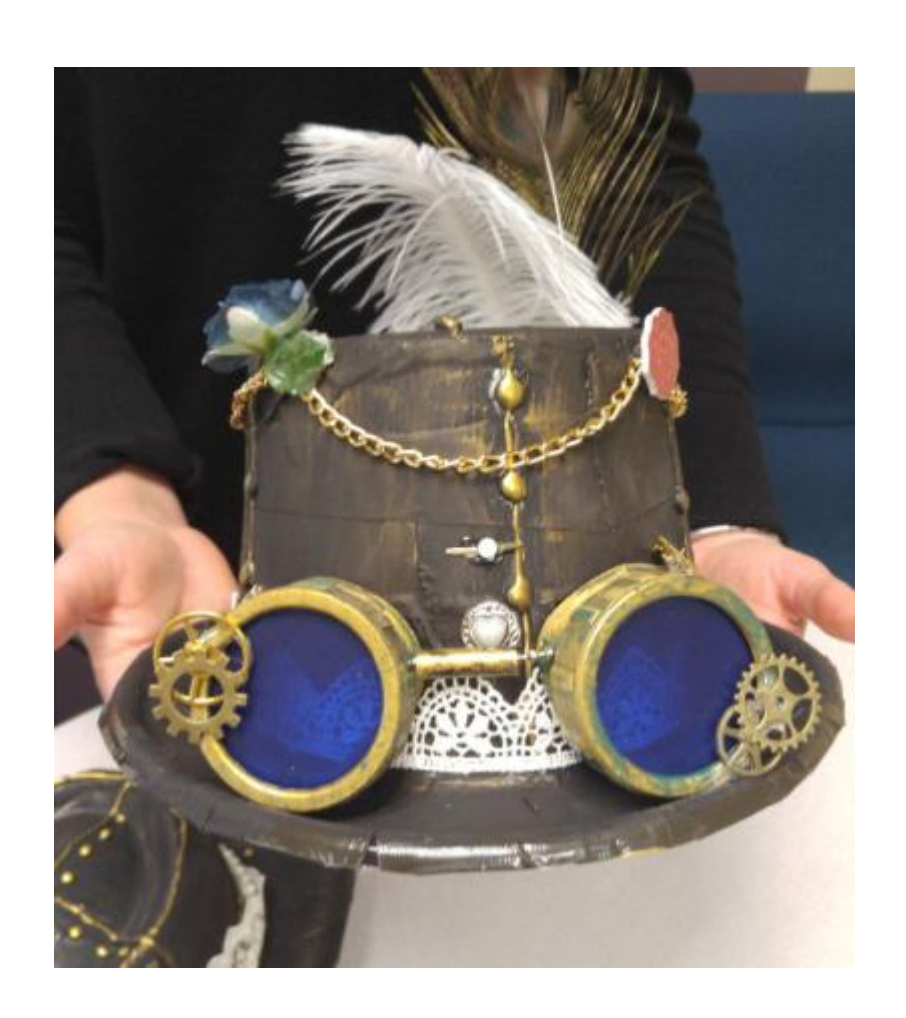
DIY Steampunk Costume Pieces