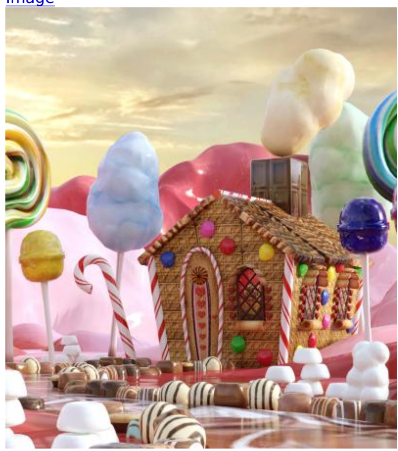
Life-Sized Candy Land