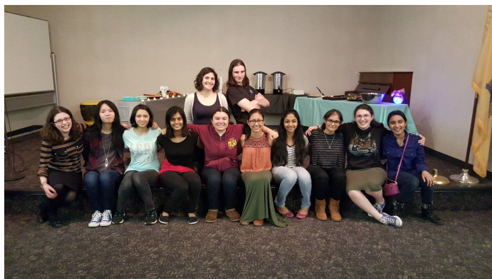
EBPL Harry Potter Alliance, Dobby’s Favorite Sock Chapter, 2016 members.

Including refreshments and allotting “mingling time” before and after the program also encourages interaction.