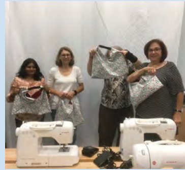
Origami Market Bags