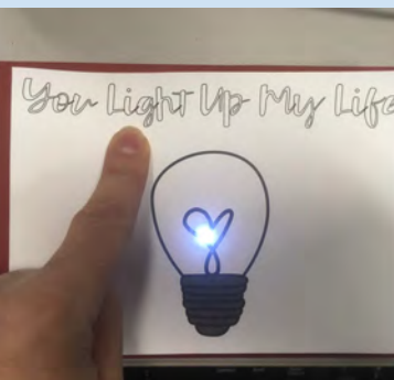
LED Greeting Card