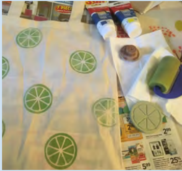
Fabric Block Printing