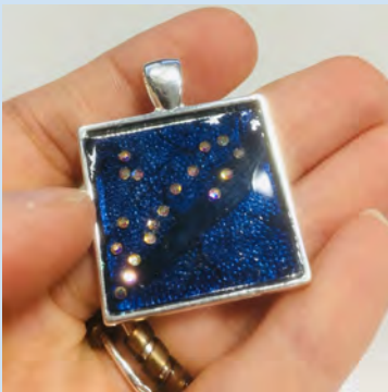
UV Resin Constellation Pendant