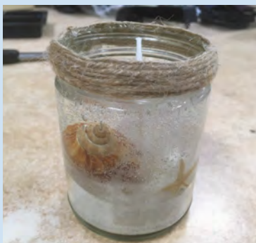
Beach Jelly Candle