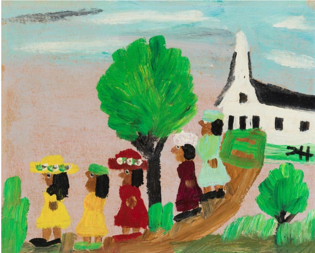
Church Ladies, 1965