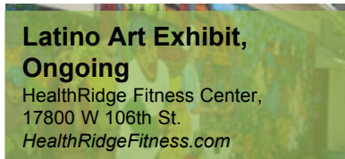
Latino Art Exhibit, Ongoing HealthRidge Fitness Center, 17800 W 106th St. HealthRidgeFitness.com