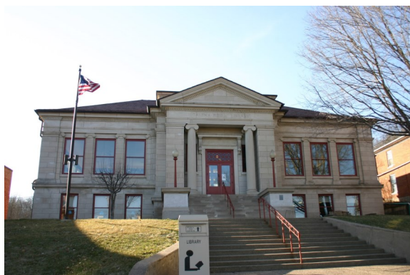
Galena Public Library