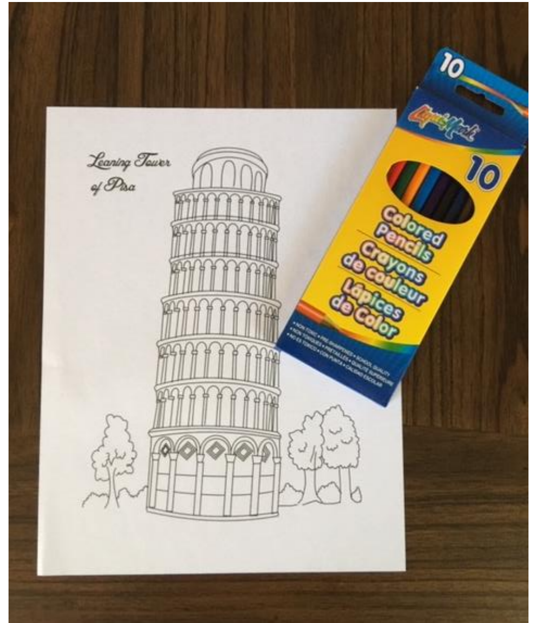
Leaning Tower of Pisa

If you are artistically inclined, you might enjoy finding free coloring pages online. Try doing a Google search with terms such as “free coloring pages Italy”. Then copy and paste an image into a word processing document and print it.