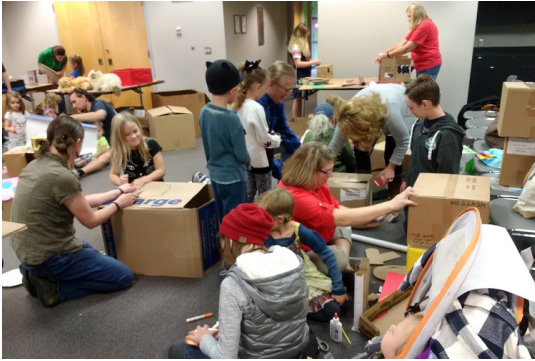
The Spokane Public Library in Washington state held 'Build Your Cat a Castle' events as a way to whittle down its boxes.